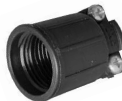
Mechanical Back Shell (Style #5)