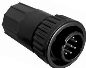
Cable Pin 3X8X-XPB-XXX Matching Mates: • Cable-Cable 5X8X-XSB-XXX • Panel 4XXX-XSB-XXX