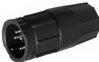
Cable to Cable 5X8X-XXB-XXX Matching Mates: • Cable Pin 3X8X-XPB-XXX • Cable Socket 3X8X-XSB-XXX